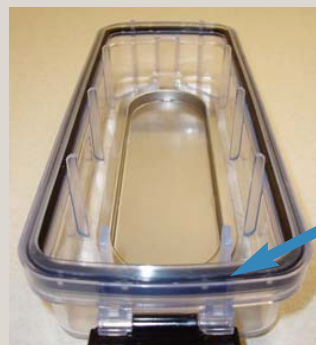
BLACK MIDDLE SEAL