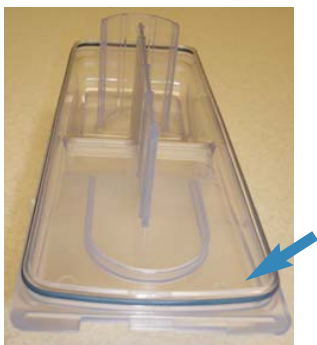
BLUE MIDDLE SEAL