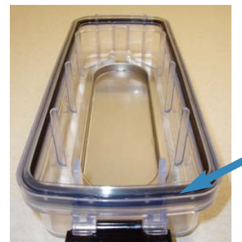
BLACK MIDDLE SEAL