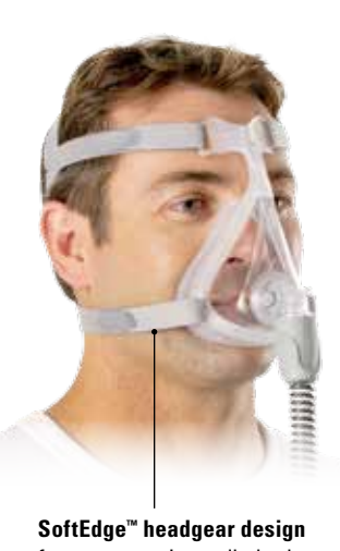
SoftEdge™ headgear design features premium rolled-edge fabric that improves comfort and reduces facial marks