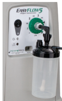
Typical Bubble Humidifier Configuration