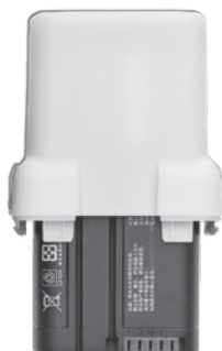
Extended Life Battery with Shuttle