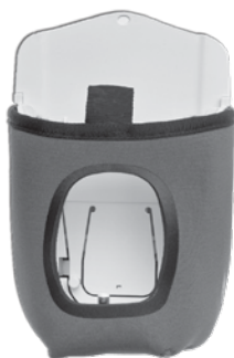
PowerShell with Neoprene Sleeve