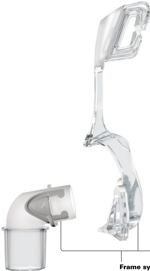
Frame system (no headgear) 62112 Mirage FX 62112 Mirage FX for Her 62126 Mirage FX Wide