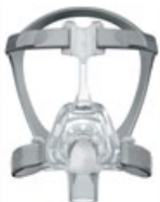
62103 Mirage FX