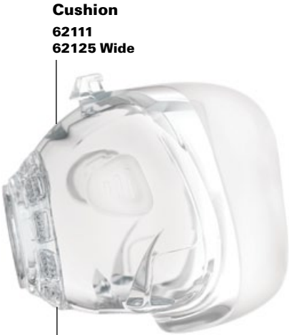
Cushion 62111 62125 Wide