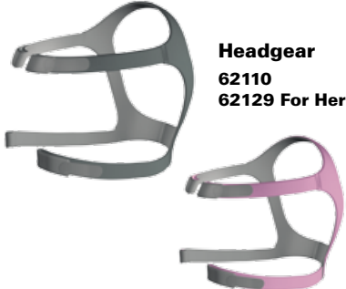
Headgear 62110 62129 For Her