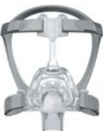
62118 Mirage FX Wide