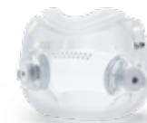
Full face for mouth breathers

Speak with your respiratory therapist to discover which Philips Respironics DreamWear cushion is right for you: