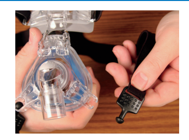
Disconnect one side of the headgear by releasing one ball-and-socket Quick Clip from the faceplate socket.