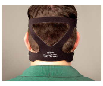
Be sure that the headgear straps are parallel and the headgear is fully extended and flat across the back of the head.