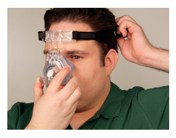
Pull the headgear over the head.

Place the mask cushion against the face.