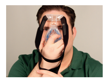
Make initial adjustments while sitting.

Place the mask cushion against the face.