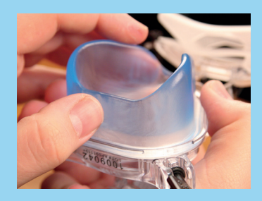
Place the cushion into the faceplate, making sure the notch for the nose is at the top (closest to the forehead pad).