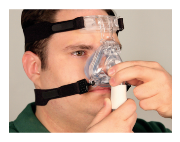
Connect the tubing to the swivel elbow and turn on the air.