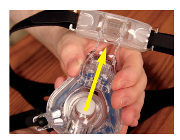
Gently squeeze the sides of the StabilitySelector and slide the arm upward to set the forehead support arm to its highest position.