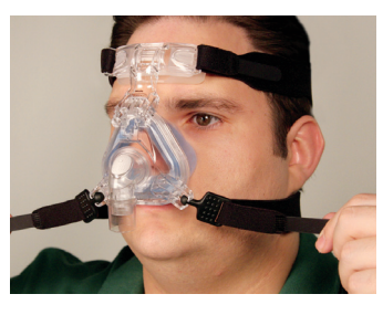
Adjust the bottom headgear straps by using the tabs. Be sure that they are tightened evenly and the mask is gently sitting on the face. Do not over-tighten the headgear.