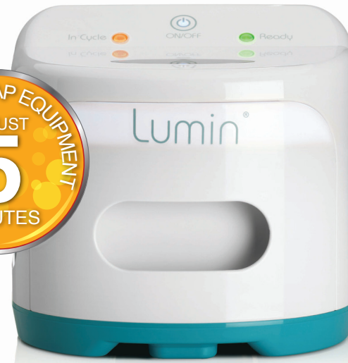
Lumin Item No. LM3000