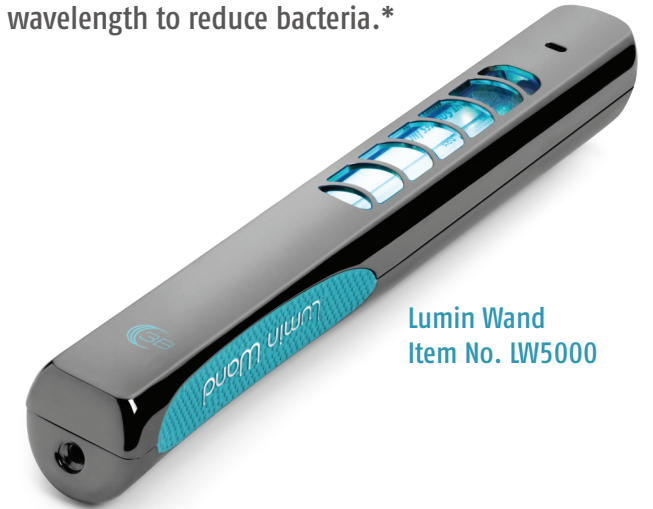
Lumin Wand Item No. LW5000

The Lumin Wand operates using a form of high energy light that is focused narrowly on the wavelength to reduce bacteria.*