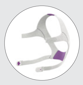
AirFit N20 for Her headgear with headgear clips