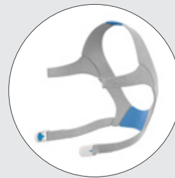
AirFit N20 headgear with headgear clips 63560 (S) 63561 (Std) 63562 (L)