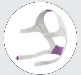
AirFit N20 for Her headgear with headgear clips 63558 (S)