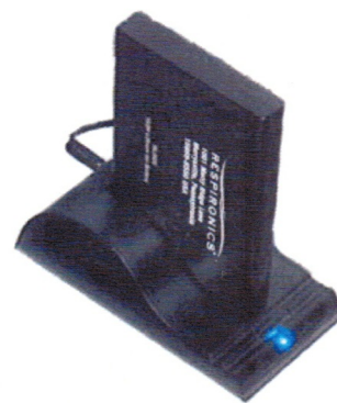
Figure 2. Battery Inserted in Battery Charger/Recalibrator