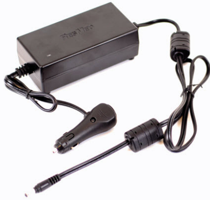
ResMed DC-to-DC converter (example)