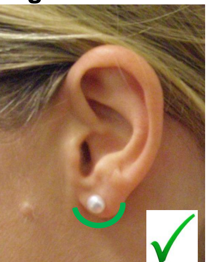
Fig 2 detached