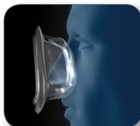
... and contracts