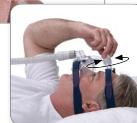
The MicroFit dial provides 24 positions of comfort at your fingertips