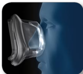
ActiveCell expands ...