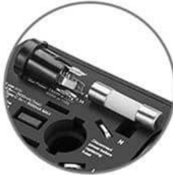
Open the fuse's cap with a coin or similar thin item