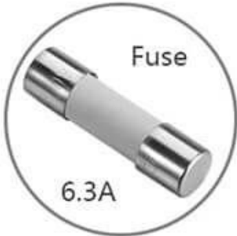
1 x Spare Safety Fuse