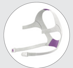
AirTouch F20 for Her headgear with headgear clips 63473 (S)