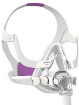
AirTouch F20 for Her Designed specifically for women.

Quick-release elbow makes it simple to disconnect from tubing when getting up during the night.