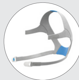
AirTouch F20 headgear with headgear clips 63470 (S) 63471 (Std) 63472 (L)