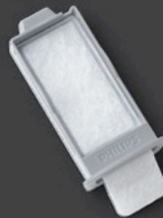
Reusable pollen filter