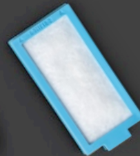
Ultrafine pollen filter