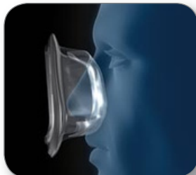
... and contracts