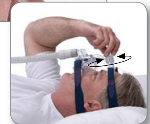
The MicroFit dial provides 24 positions of comfort at your fingertips