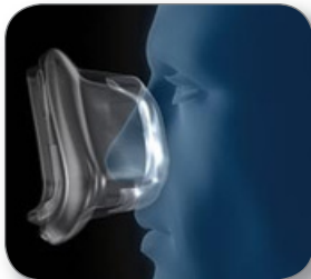
ActiveCell expands ...